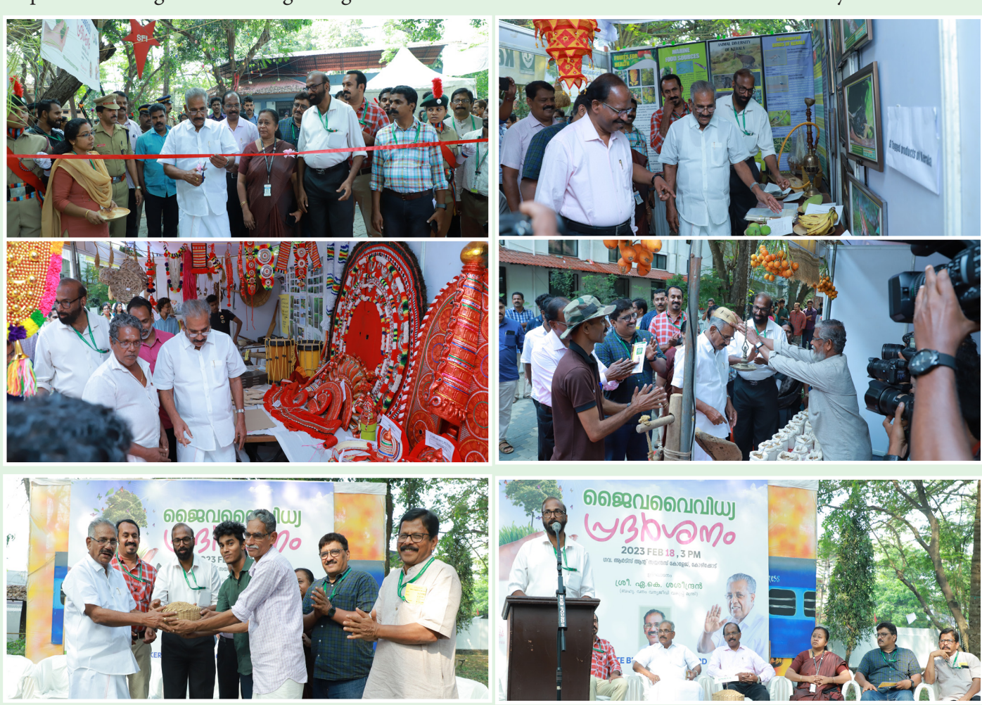
Inauguration of Biodiversity exhibition by Shri. A.K. Saseendran, Hon'ble minister for forest and wildlife

congress by providing prizes for the best stalls and also participation certificates. As part of the exhibition, cultural programmes were also organised and it included biodiversity awareness through magic, mime, dance, songs, etc. Many dignitaries visited the exhibition and mentioned that the exhibition is very informative and excellent. The exhibition was highly appreciated by visitors as well as the media for being very informative and helped in creating awareness regarding conservation and sustainable utilisation of biodiversity.