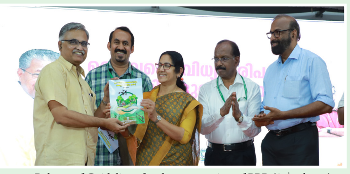
Release of Guidelines for the preparation of PBR (2<sup>nd</sup> volume)

Along with the biodiversity congress, a BMC Meet was conducted on 20<sup>th</sup> February. The programme was meant exclusively for the Chairpersons, Secretaries and Convenors of BMCs constituted at local bodies. KSBB invited all the BMCs from Malappuram, Kozhikode, Kannur & Kasaragod districts and selected BMCs from the rest of the ten districts which included the BMCs undertaking KSBB aided local biodiversity conservation activities and preparation of local biodiversity action plan and also the BMCs which