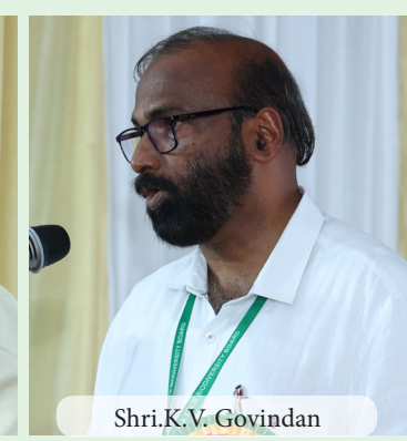
EKAA January - March 2023 Volume - 3, Issue - 1