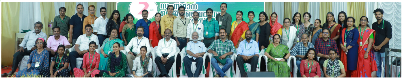
Valedictory session of 2<sup>nd</sup> KSBC