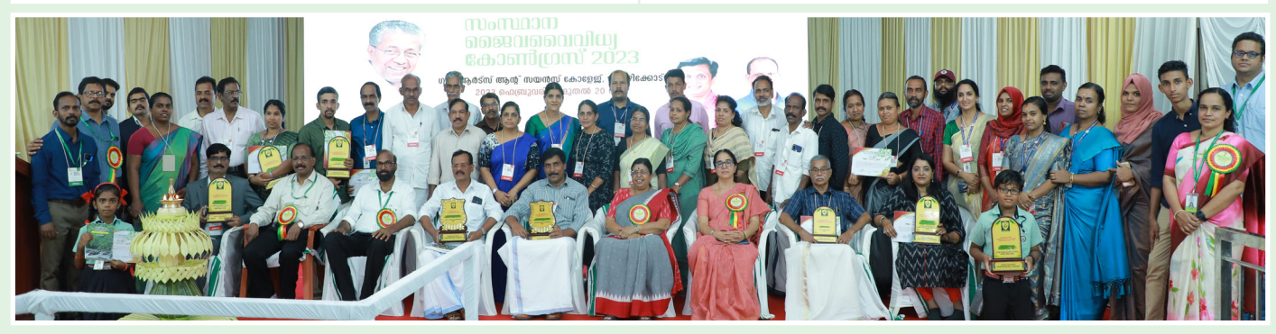
Distribution of Biodiversity awards by Shri Pinarayi Vijayan, Hon. Chief minister of Kerala