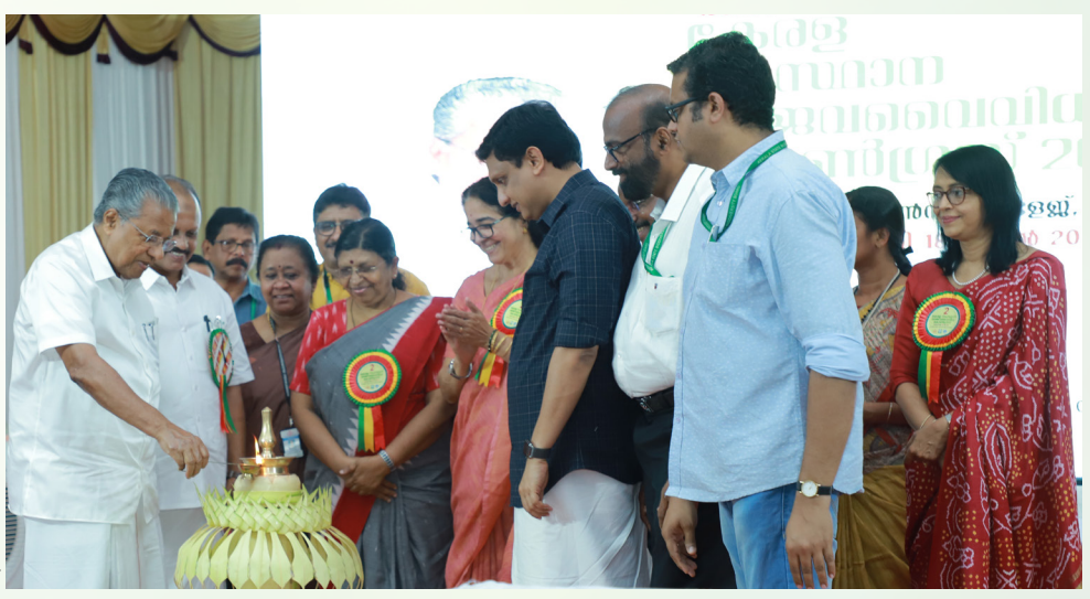
Inauguration of 2<sup>nd</sup> KSBC by Hon'ble Chief Minister of Kerala

Kerala is having a variety of ecosystems such as forests, grasslands, wetlands, coastal and marine ecosystems which harbour our unique biodiversity richness. Recent analysis shows that over 150 species of plants that are either indigenous or naturalized in Kerala are used in the Indian system of Medicine like Ayurveda and Sidha. The rural folk and tribal communities