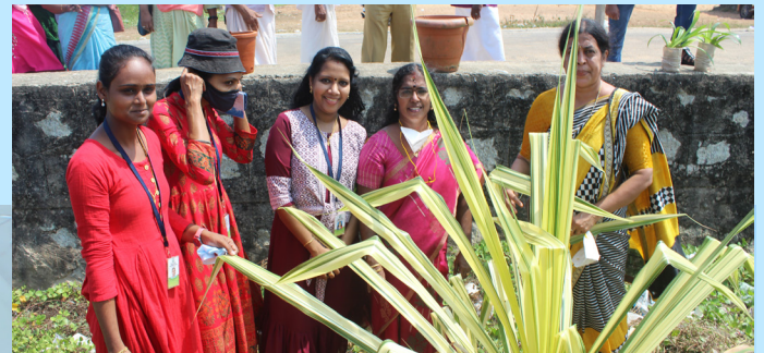
KSBB women staff and BMC members planting Pandanus as the program was organized on women's day